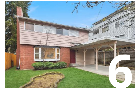
2302 NE 91st St Seattle, WA 98115

Sale Price $1,035,000 Lot Size 5,100 SqFt Plans Remodeling existing SFH, building DADU Sale Date 07.05.2022