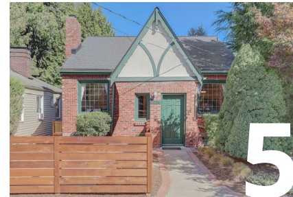
1214 NE 98th St Seattle, WA 98115

Sale Price $1,400,000 Lot Size 10,200 Plans Split lot, Build SFH, DADU & AADU on each lot Sale Date 07.06.2022