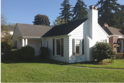
Two Ravenna Single Family Lots 7728 20th Ave NE, Seattle, WA 98115