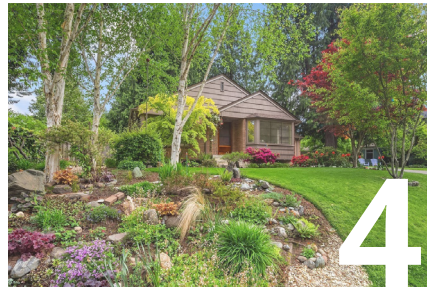
3849 NE 88th St Seattle, WA 98115

Sale Price $1,126,000 Lot Size 9,581 SqFt Plans SFH, AADU & DADU Sale Date 10.20.2022