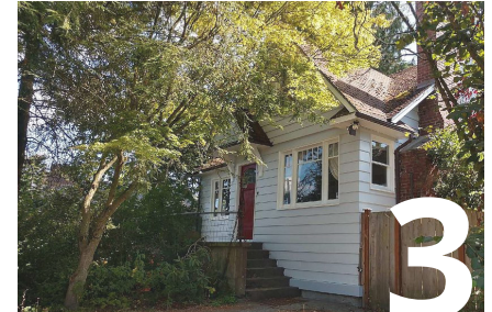
1211 NE 97th St Seattle, WA 98115

Sale Price $975,000 Lot Size 8,064 SqFt Plans SFH & DADU Sale Date 12.13.2022