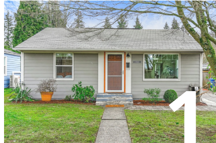
11322 14th Ave NE Seattle, WA 98125

Sale Price $779,000 Lot Size 6,850 SqFt Plans Build SFH, DADU & AADU Sale Date 03.24.2023