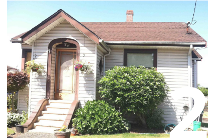
8913 8th Ave NE Seattle, WA 98115

Sale Price $779,000 Lot Size 6,850 SqFt Plans Build SFH, DADU & AADU Sale Date 03.24.2023