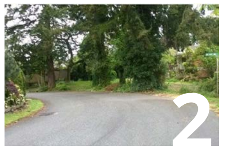
14727 35th Ave NE

Lot Size 41,595 Sales Price $6,500,000 Price/Foot $156 Zoning NC3-75 (M) Sale Date 11.18.2023