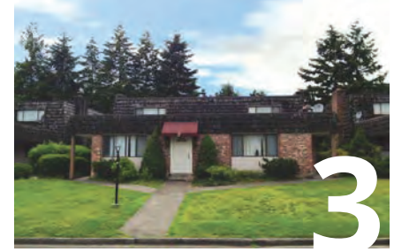
Fairlake Four Bellevue, WA