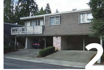
7th Place Fourplex Bellevue, WA