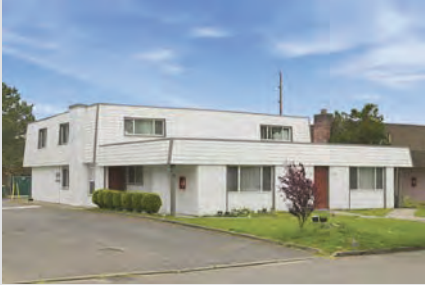
Bellevue Fourplex Bellevue, WA