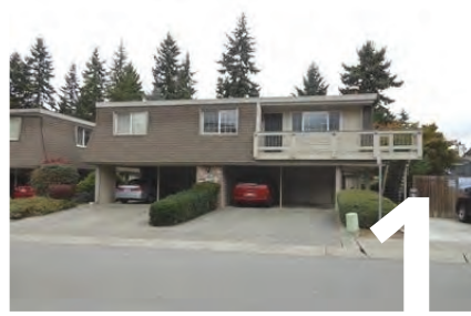
6th Place Fourplex Bellevue, WA