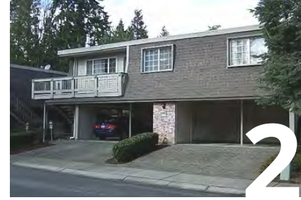
7th Place Fourplex Bellevue, WA