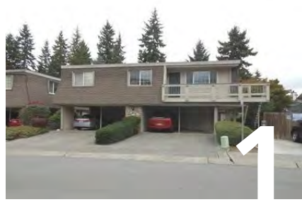
6th Place Fourplex Bellevue, WA