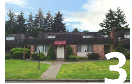
Fairlake Four Bellevue, WA