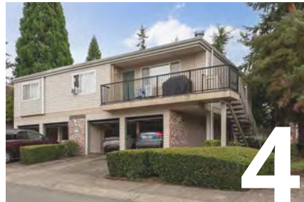
Bellevue Fourplex Bellevue, WA