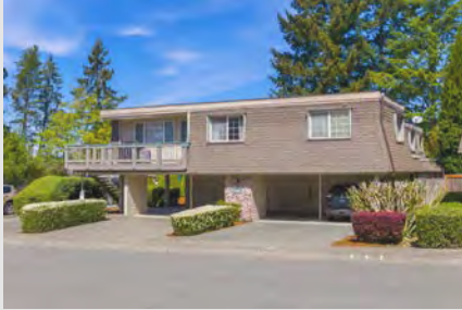
Stoneridge Fourplex Bellevue, WA